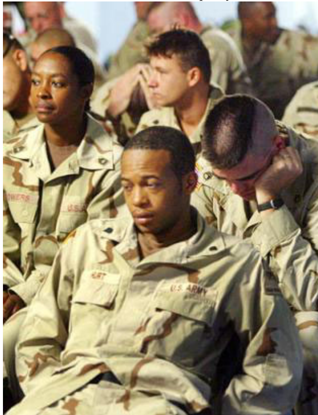
Soldiers await their flights back to Iraq in Frankfurt, Germany. How many more for Bush's war?

“I missed Vietnam. I thought about retiring after Desert Storm. I should have. [Iraq is] classic FUBAR. ... A mission without a goal. An engagement without rules. The intel was pure FUBAR. No exit strategy. We're going to be there for a long, long time. Maybe people are right. Maybe it is another Vietnam. We were in Vietnam for 10 years. ... I've been a professional soldier most of my adult life. I've been proud to serve my country even when I thought we might be wrong. But I'm not proud now. And that makes me want to puke.” – Anonymous reservist after returning home from Iraq.